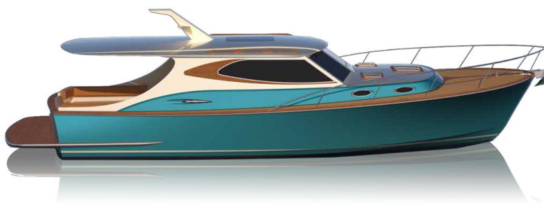
Extended Roofline Option